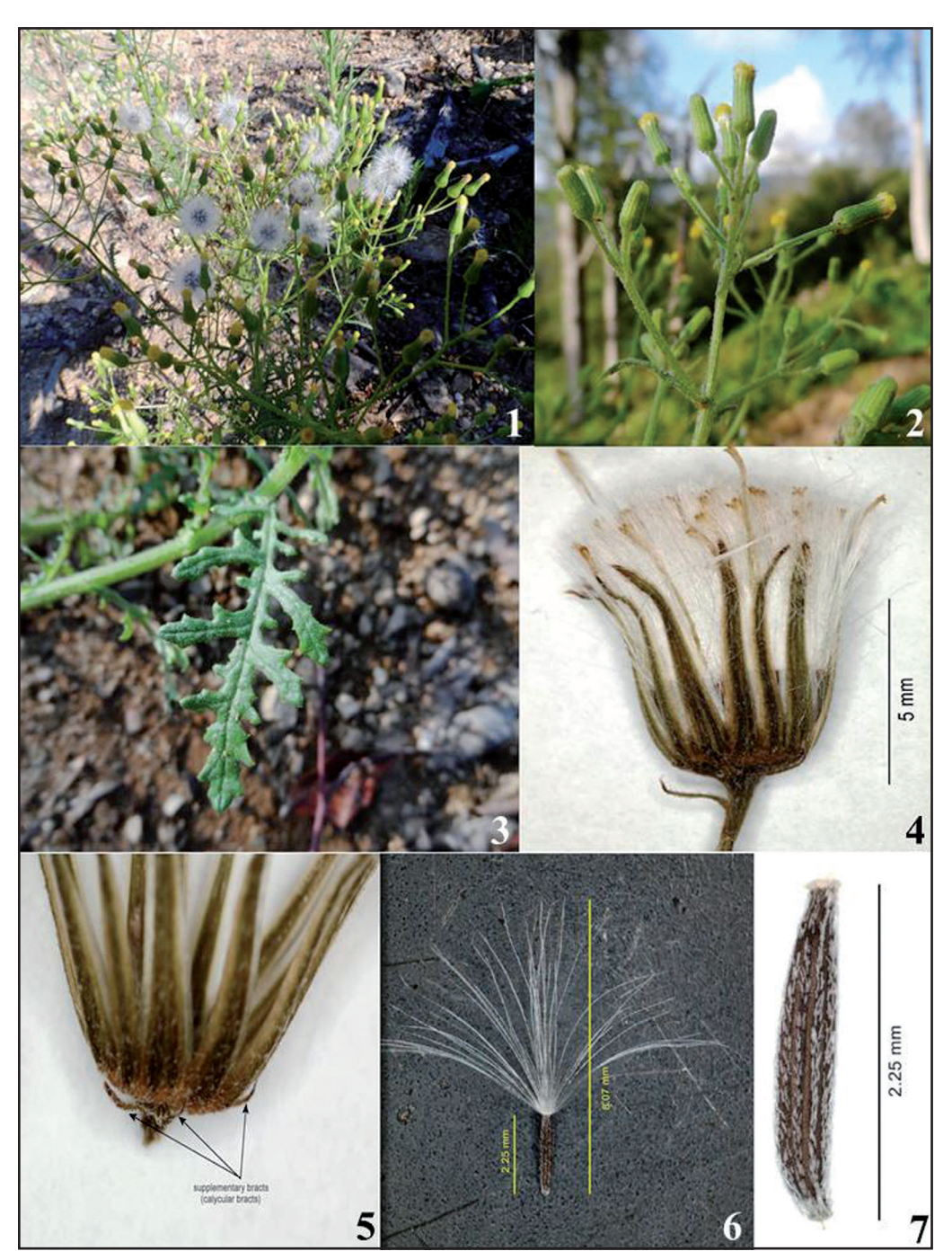
Fig. 1. General appearance of Senecio sylvaticus L.

Wood-margins and disturbed ground, especially on sandy soils. From Central Fennoscandia and North Central Russia southwards to Central Portugal, Central Italy and Bulgaria (cf. Chater & Walters 1976). Location/New localities: Examined specimens of Senecio samples were collected from the western part of the Black Sea Region A3: Zonguldak; Ereğli and Alaplı in the 2014 vegetation period. The samples from Ereğli were collected from Karakavuz location – 1000 m a.s.l., on 22 August, and the samples from Alaplı